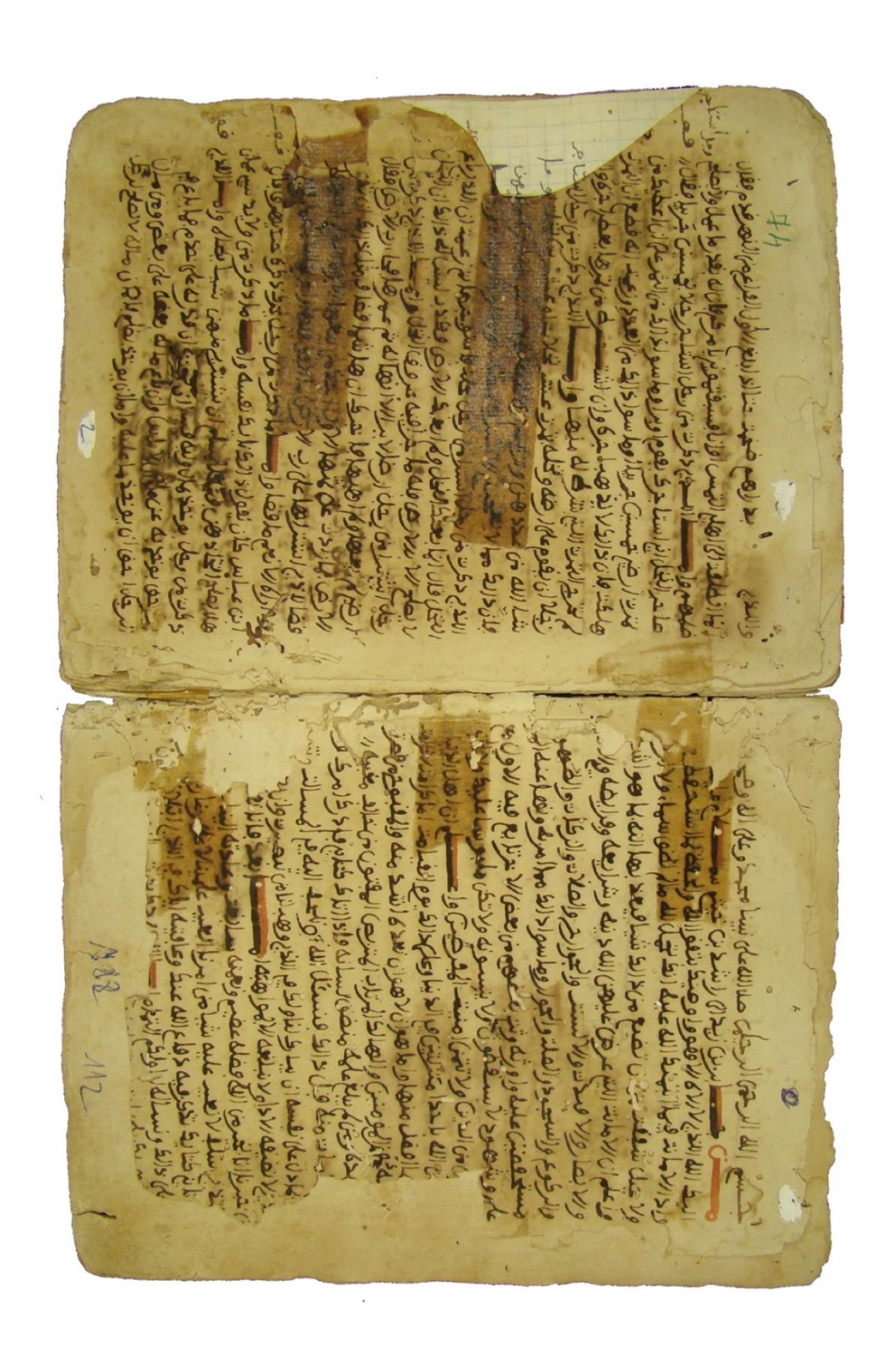
Image 1: First and second pages of the manuscript from al-Bārūnīya Library, Djerba, Tunisia, category Fiqh Ibāḍī, Number 28.