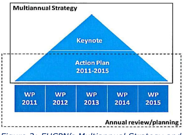
Figure 2: EUCPN's Multiannual Strategy and annual planning

The EUCPN's basic goals are reaffirmed in the Multiannual Strategy which was adopted by the Board in December 2010 for the period 2011 until the end of 2015, as shown in figure 2 below. The Multiannual Strategy 2011-2015<sup>36</sup> sets out the long-term orientations for the Network.