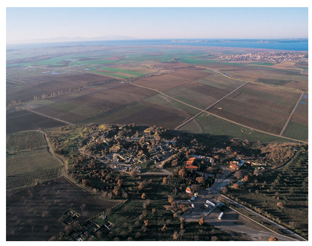
Fig. 1 Aerial view of Troia from southeastern direction (Hakan Öge).

These mutual visits marked the beginning of a long and fruitful collaboration that grew into friendship. From then on we received samples from the excavations of Manfred Korfmann for