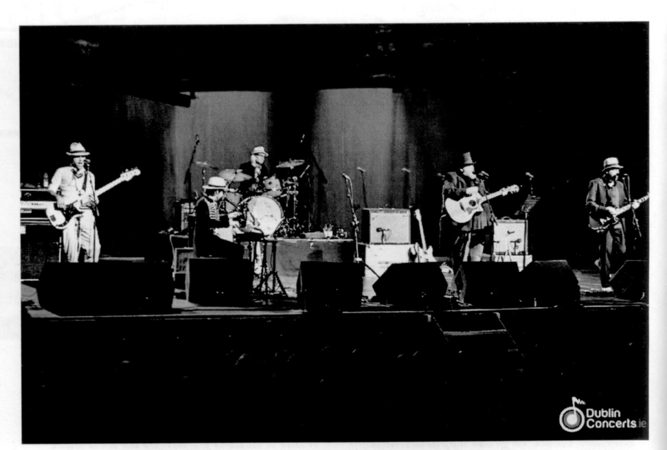
The Duckworth Lewis Method live at the Olympia Theatre, Dublin, November 27, 2013. HARD TIMES – Nr. 95 (1/2014)

turned up to record some spoken word parts for the track. Similarly, legendary cricket commentator Henry Blofeld is heard in spoken word passages on "It's Just not Cricket", a nostalgic rejection of corrupting influences of all kinds (inauthentic entertainment, commercialization, baseball) also released as a promotional single with another visual take on the Stones' Sticky Fingers cover (cf. "It's Just Not Cricket" front and back cover).