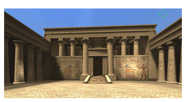
Figure 1. Gates of Horus: the courtyard.

Gates of Horus is an educational game based on our Virtual Egyptian Temple.<sup>1</sup> The student assumes the role role of a young prince being schooled in the mysteries of the temple by asking the high priest for explanations of temple features. In turn, the priest tests the student's understanding by asking his own questions, and rewards accurate responses by allowing the student to go further into the temple. The student "wins" by answering a final set of questions in the inner sanctuary, which elicits spoken praise from the divine image of the temple god (Horus).