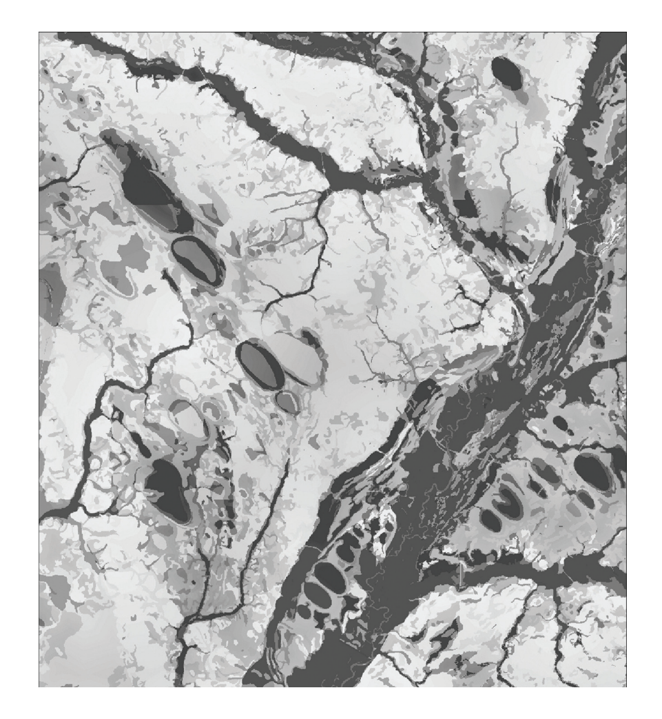
Figure 5. One of the 46 probability surfaces (detail): lighter = greater potential for ar chaeological resources.