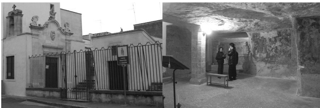
Figure 1 Byzantine Crypt, a) two outside entrances, b) interior located underground

When trying to present the history of a heritage site, the use of spa-