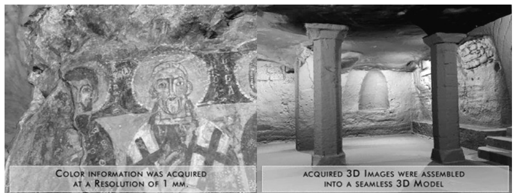
Figure 4 Movie: a) view of crypt without texture, b) view of main pillar with texture

The potential of modeling as-built reality in heritage opens-up applications such as virtual restoration or as an input to virtualized reality tours. As demonstrated with a Byzantine Crypt, a high degree of realism can be attained by those techniques and the context in which the artifacts were discovered or were used can be recreated. Real world acquisition and modeling is now possible. Technological advances are such that difficulties are