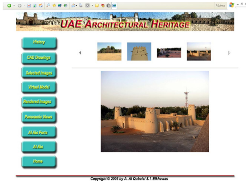
Figure 3: Non-interactive Internet Based Picture Book System.

Some of these captured images were also later used to create a number of Pseudo-3D-immersive Environments. Here, Pixmaker ® was utilized to stitch a consequent set of images together utilizing the technology presented by Apple Quicktime. This process forms partial or full 360 degrees panoramic images of the monument site that can be displayed online. The user can literary look around the monument, and zoom in and out on demand (Figure 4).