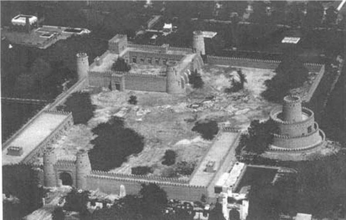
Figure 1: Al-Jahili fort simple geometry and texture

This work is a starting step in the effort of the 3D documentation of the architectural heritage in the UAE. It sets the stage for others to step-in and actively participate in this process. It also provides a working example to be generalized and followed by other teams. In the long run, this effort should cover the entire architectural heritage of the UAE and combine them in an online virtual library. This library would not only help in increasing the local cultural awareness, but would also help in introducing these cultural icons to the general public world wide.