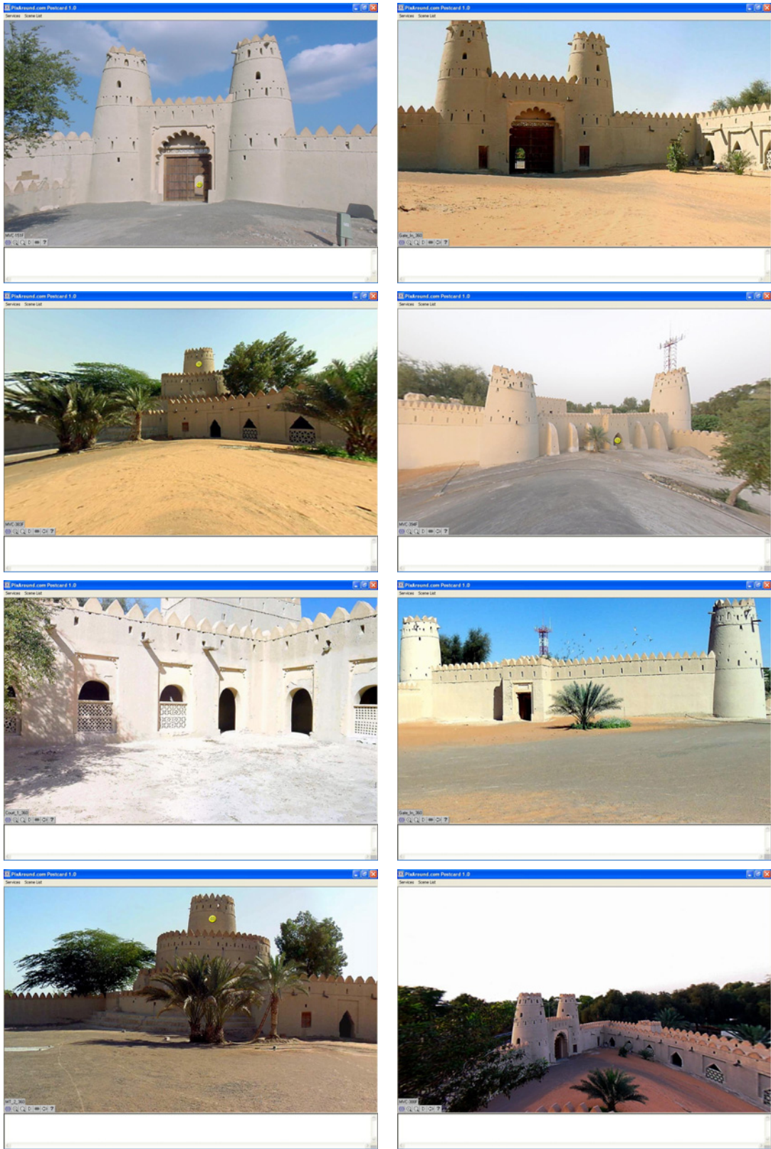
Figure 5: Scenes from the Nested Pseudo-3D-immersive Environment