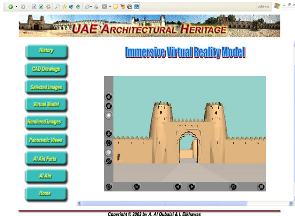
Figure 6: Al-Jahili VRML-Based Virtual Model.

As a mentioned earlier in Section 3.3, a three-dimensional AutoCAD model was constructed using both the survey and the digital images. In this step, however, the aim is to produce a VRML model of the monument. This process started by exporting the 3D model from AutoCAD to AutoDESK VIZ 4. Since the model was huge in size (55 MB), several steps have to done to successfully import the model.