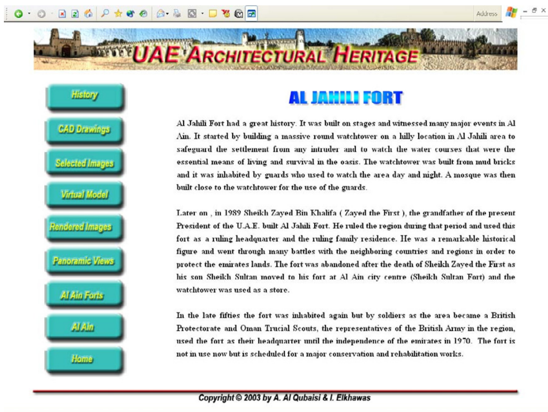
Figure 2: Web-based History Documentation.

The history of the fort was embedded into a Web-based Document to be viewed by the general public. This web-text document includes all verified historical information as well as the verified stories of previous users of the fort. It also includes some old photographs and postcards of the fort that show the original settings of the monument (Figure 2).