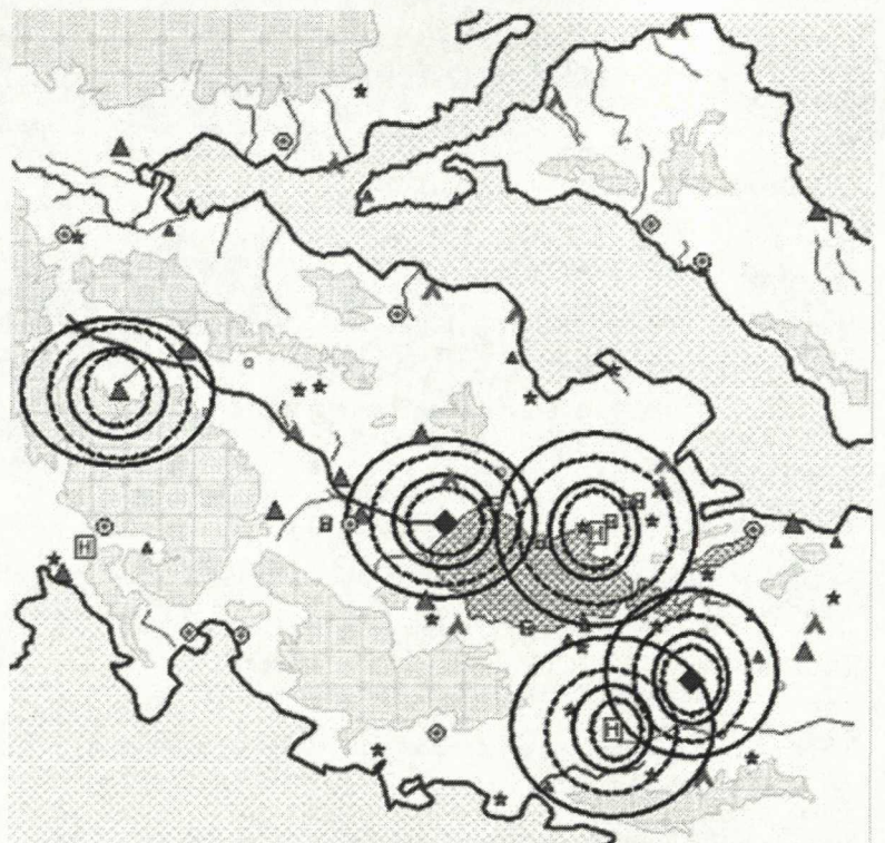
Figure 3. Proposed variable ViewSheds and SoundSheds, superimposed