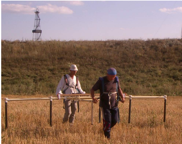
Fig. 1. Geomagnetic prospection (profile distance 1 m) at the Belsk settlement; in the back the rampart of the Zapadnoye goridišče (oil rigs in the back).

entific excavation and attributed it to the Scythian period.