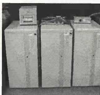
Figure 1 The 3DMURALE Database Servers

Likely candidates for database platforms included MySQL, PostgreSQL, MS-Access, MS-SQL Server 2000. A database system intended for archaeologists must be as low-cost as possible. Using the prevalent open source databases can bring down the cost of the archaeological information system.