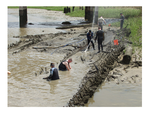
Figure 2. Clearing debris and sediment from the starboard side of the hull.

accumulated sediment and debris. Basic measured drawings were made of diagnostic features of the wreck. In addition, measurements of design and construction features were made to confirm subsequent laser mapping. Photographs were taken to record exposed sections of the hull. When recording and photography of the starboard side of the vessel was complete, the laser system was used to collect points identifying all exposed features.