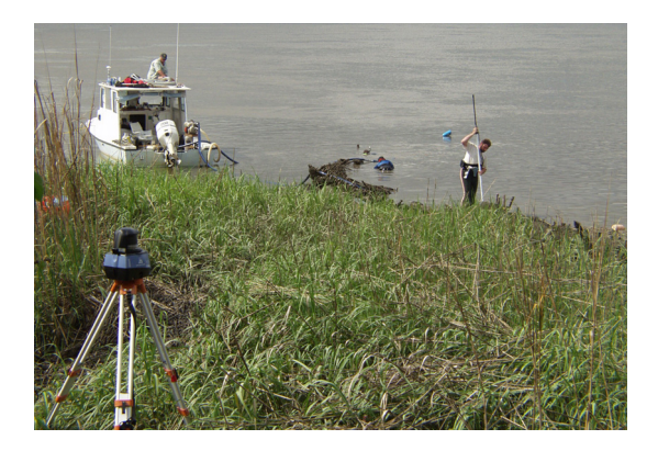
Figure 3 . One of two laser transmitters mounted on tripods in the marsh.

The two laser transmitters were mounted on tripods in the marsh south of the wreck (see fig. 3). The system was calibrated using a combination of the datums and permanent references on the hull, such as well-secured bolts, spikes, and pins. Once calibrated, the laser was used to record a sufficient number of data points to define the three-dimensional characteristics of each feature. Working for a total of four days in between tides, the laser system was capable of recording thousands of three-dimensional data points. In the same amount of time, traditional methods would produce less than 10% of that number. As the tide ebbed, mapping proceeded aft and as it rose, mapping activity returned toward the bow.