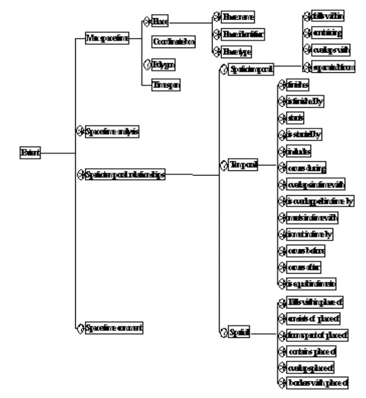
Fig. 2. Part of the Schema: Spatiotemporal Extent.

The first ("Max space time") serves rough orientation and narrowing down database searches for finds: The total of all places where the period flourished at any time is approximated by an outer (larger) spatial bound. This might be by the identifier of a geopolitical of geological unit, or by a geographical polygon, or both. The starting phase and the