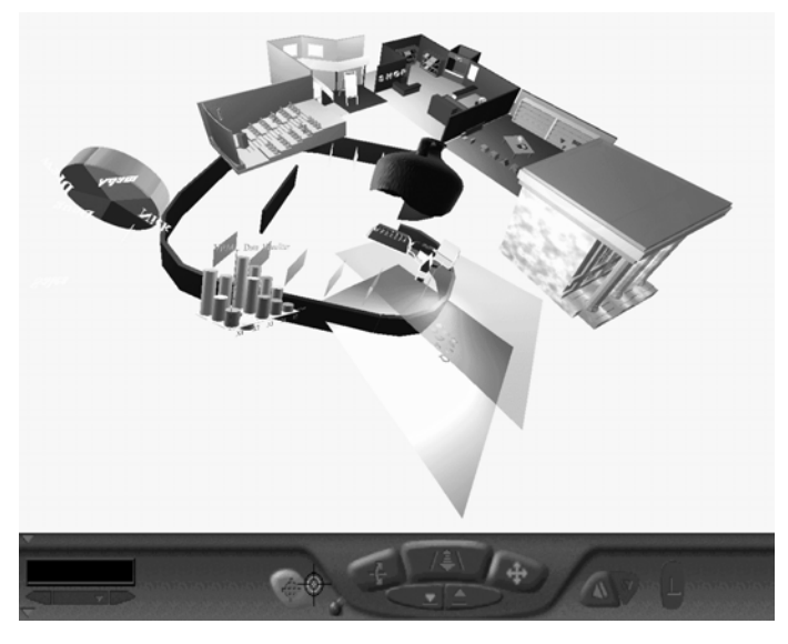
Figure 2: Layout of the spatial media and display test-bed.