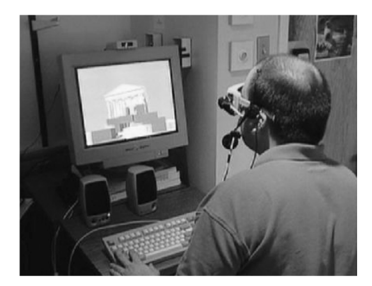
Figure 6: The desktop VR system.