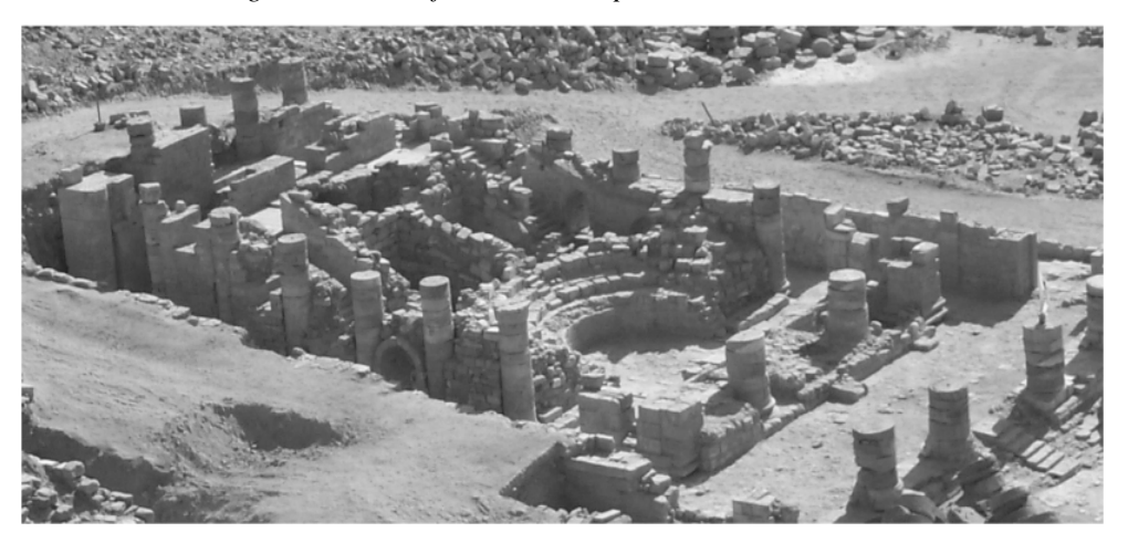
Figure 2: Aerial showing the Temple Proper area of the Great Temple precinct after the excavation season, 1999.

lational data between artefacts and site features cannot be represented in this method. For example, architectural features that have physical clues (stucco finishes, construction irregularities, evidence of building additions etc.) may be useful only when viewed in a context with associated finds and site features.