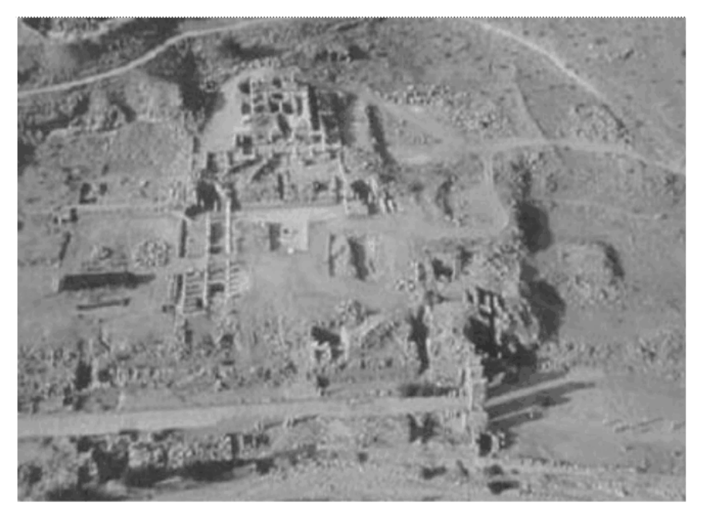
Figure 1: Aerial of the Great Temple site in Petra, Jordan.