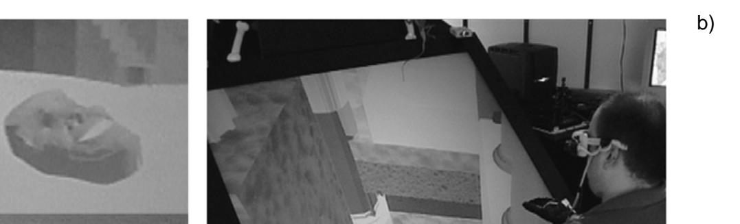
Figure 5: (a) User using a head mounted display to investigate artifacts in the system. (b) User navigating through trenches using the Barco Baron workbench system.

this, they will be asked to answer basic questions about their findings in the system. Users will also be asked to attempt to answer similar questions using the traditional site database and maps available in Filemaker Pro on the desktop.