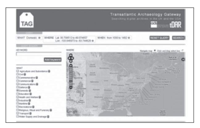
Figure 2. The map area selection module (Open Layers).

The 'What' facet of the query was probably the easiest element to create a user interface for. The simplest and most direct method was to use radio buttons to allow users to select one or more of the functional group search terms. These can also be removed from the query by means of a delete button (a green and white 'X') next to the selected term in the 'query section of the page'.