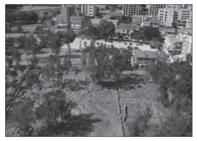
Figure 1. The archaeological excavation of Agios Georgios Hill in Lefkosia (Cyprus).

CAA2011 - Revive the Past: Proceedings of the 39th Conference in Computer Applications and Quantitative Methods in Archaeology, Beijing, China, 12-16 April 2011