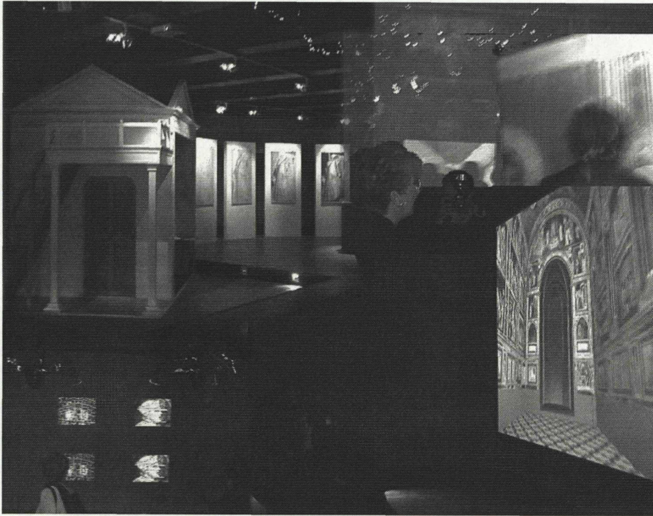
Figure 2 The Wiegand Multimedia Room

Apart the above mentioned installations, other five applications were realized, partly non-interactive, partly interactive, partly semi-immersive. The first Installation is an introductory DVD, a multivision that welcomes the public in the virtual museum (Fig.2, right). This is a non-interactive video, in five languages, realized with compositing techniques, using only graphic materials and 3d animations. The visitor feels to be involved in the story because it is made by Enrico Scrovegni himself, with his human vicissitude, his relation with Giotto, in a dramatic tone.