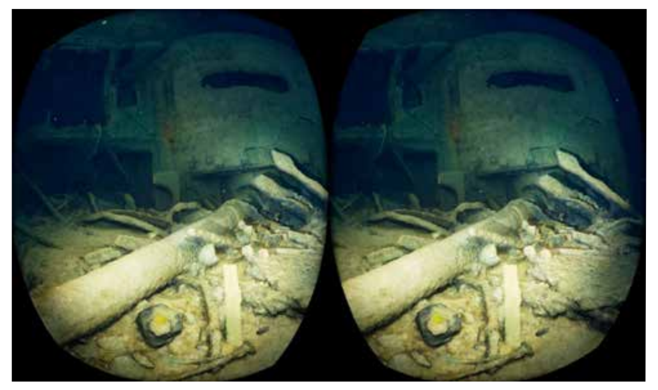
Figure 7. Still from HMS Hampshire VR environment developed at the 3DVisLab, University of Dundee, 2017.

tions (see Earl 2013). In the context of film there is an implied authorship understood by an audience who are aware that what appears on screen is some combination of artificial illusion and natural reality. This is reinforced by the format of The Caterthuns which is framed as the result of a creative process, revealing only a partial impression of a dynamic and multifaceted landscape which extends beyond the frame.