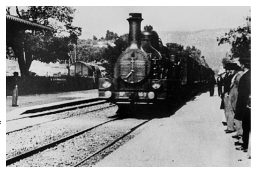
Figure 1. Still from The Arrival of the Train at the Station, Auguste and Louis Lumière, 1896, public domain image.

theory and examples from the author's creative research-practice. Insights can thus be gained through practice - particularly relating to the tensions between lived experience and visual media - that would be difficult to access through purely textual enquiry (see Cazeaux 2006; Biggs 2004).