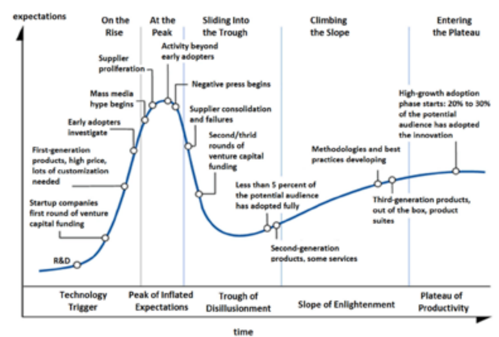
Figure 3. General Gartner Research's Hype Cycle, diagram drawn by Olga Tarkovskiy (CC BY-SA 3.0), 2013.

erated imagery that tend towards "realistic" representation, today it more often refers specifically to the embodied interaction enabled by HMD technologies and motion control devices (figure 2). "The notion of the real" - Coyne states - "is intimately connected with embodiment" (1999: 49). Just as we might pinch ourselves to check if we are dreaming, as we look around in VR the live feedback loop that we receive convinces us in part that what we are seeing is real. This "reality check" is a type of reality illusion that is quite distinct from photorealism. Where in the past illusions of reality have primarily relied upon "visual fidelity", Manovich argues that digital interactive media "construct the reality effect on a number of dimensions [including] bodily engagement with a virtual world (for instance, the user of VR moves the whole body)" (2001: 182). As such we can say that VR as we know it today is by its very nature interactive. To remove that bodily interaction would be to remove the primary illusion upon which the virtual reality is based.