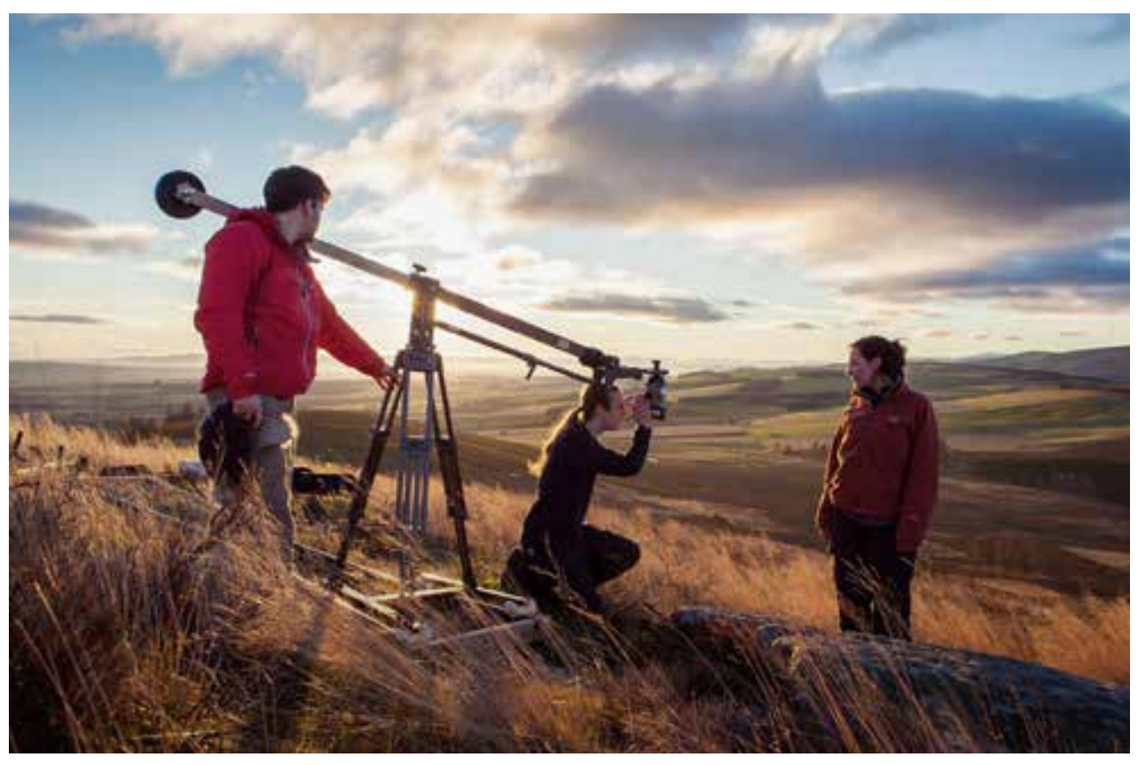
Figure 4. Ground-based filming for The Caterthuns film, photograph by Kieran Duncan, 2013.

creative decision making during production of the practical outcomes was affected by the limitations and affordances of the respective media. As a point of comparison the first example is a short film created during the author's PhD research, while the second is a VR environment developed at the 3DVisLab at the University of Dundee. Both projects aimed to create an emotive sense of place based upon real-word heritage environments. This sense of place is considered to be an important platform for communicating archaeological knowledge because it can be shared by specialists and non-specialists alike. Beyond this the experiences surrounding heritage sites can be an integral part of their archaeological interpretation. Despite the common aims of the two projects, the means by which real-world feeling and atmosphere was translated into digital content was markedly different in each case. This was governed partly by the situation of the sites themselves but largely by the disparate affordances of the two media used.