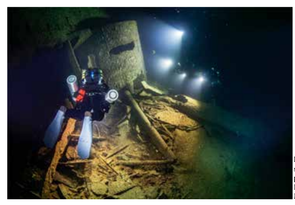
Figure 6. The underwater survey team conducting photogrammetry on the HMS Hampshire, photograph by Marjo Tynkkenen, 2016

tion of filming and digital synthesis from still photographs. In practical terms these movements help to reveal the three dimensional form of the landscape (via parallax) but also afford an impression of flight above, and passage through, the landscape. Castro describes how aerial tracking cinematography can evoke "emotion" linked to both the feeling of flight and discovery of the landscape below (2013: 125).<sup>5</sup>