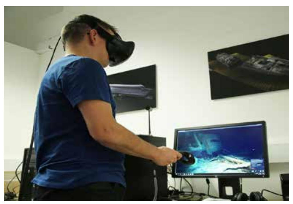
Figure 2. Using a HMD and motion controllers, photograph by the author, 2017

of cinema then lies in the aesthetic of the uncanny, or in the tensions of a partial reality, rather than in any manifestation of Bazin's total reality. This is evident in the explicitly artificial visual language of film today where constructs such as cuts, dissolves and montage - that have no equivalence outside of the film world - form part of a widely accepted visual syntax that is integral to the medium.