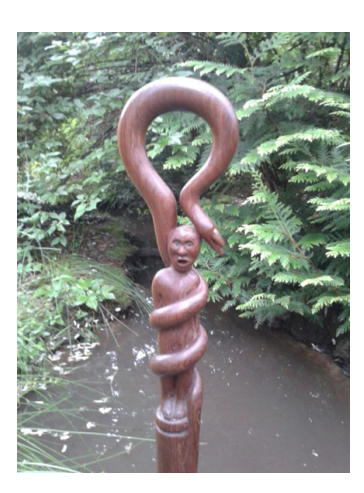
Image 1: symbolic staff, wood carving o the VhaVenda people, Limpopo Province, SA, 2014

The messenger snake – commissioned by the ancestors or by the "river people" as nature spirits - makes Chaka die a symbolic death and enwraps him to convey its powers to him. The whistling has connotations of spirit mediumship, since collective ancestral spirits are said to communicate in this way.<sup>34</sup> After this vision, the diviner who had been his mentor at a distance passes her responsibilities for Chaka into a successor, who appears in the next spiritual sequence of Chaka's preparations.